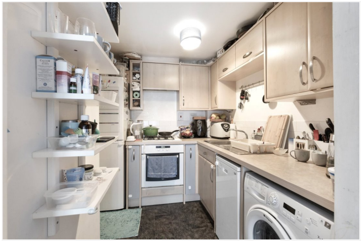
BLYTHESWOOD PLACE, SW16 £275,000 LEASEHOLD