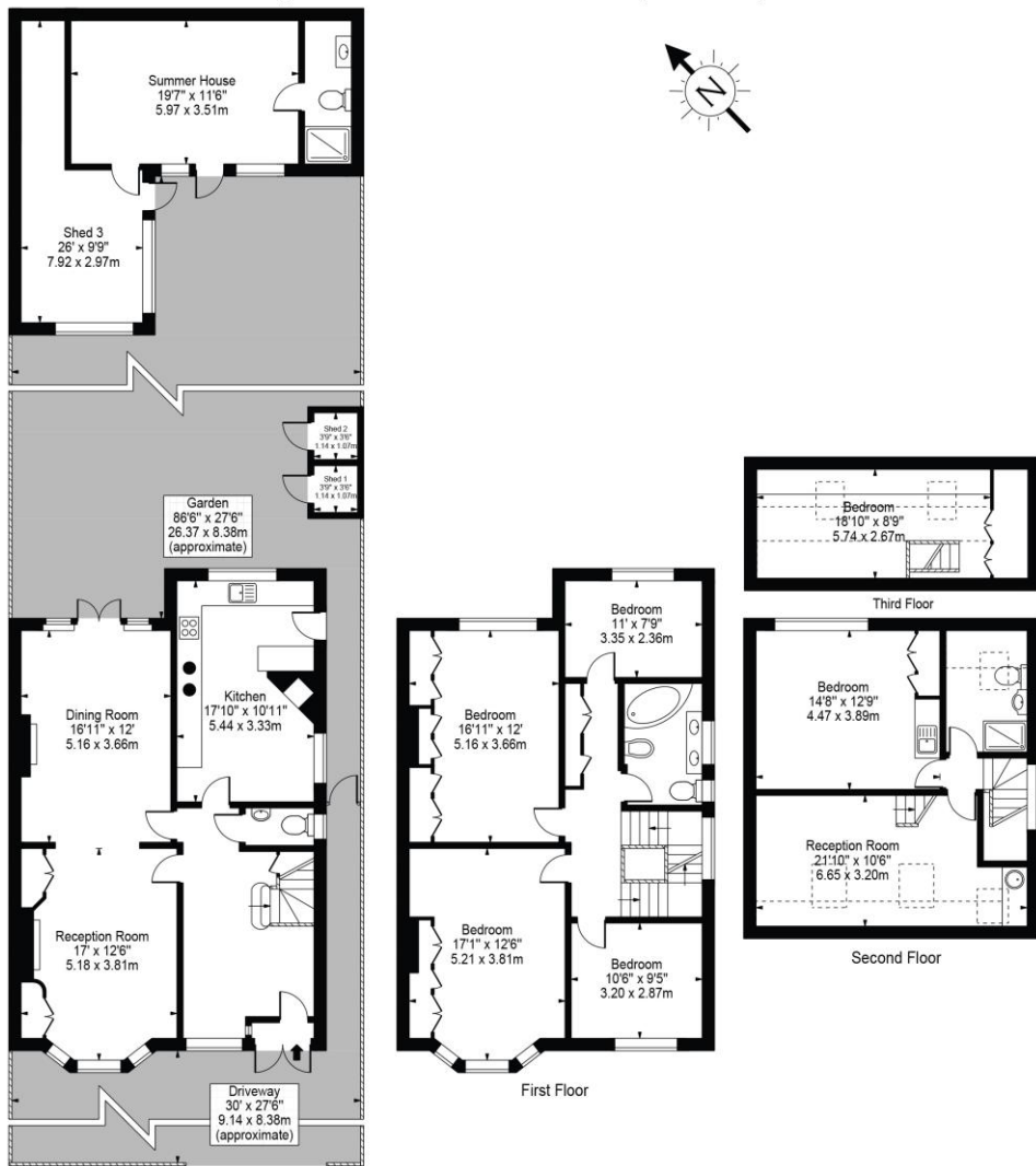
For Illustration Purposes Only - Not To Scale Floor Plan by Mira Nikolova Photography

Approx. Gross Internal Area 2359 Sq Ft - 219.16 Sq M (Including Restricted Height Area, Excluding Summer House, Shed 1, 2 & 3) Approx. Gross Internal Area 2188 Sq Ft - 203.26 Sq M (Excluding Restricted Height Area, Summer House, Shed 1, 2 & 3) Approx. Gross Internal Area Of Summer House 273 Sq Ft - 25.36 Sq M Approx. Gross Internal Area Of Shed 1 13 Sq Ft - 1.22 Sq M Approx. Gross Internal Area Of Shed 2 13 Sq Ft - 1.22 Sq M Approx. Gross Internal Area Of Shed 3 168 Sq Ft - 15.61 Sq M