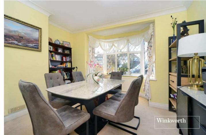
BRADSTOCK ROAD, EPSOM, SURREY, KT17 £695,000 FREEHOLD

A WELL-PROPORTIONED SEMI-DETACHED FAMILY HOME IDEALLY SITUATED CLOSE TO STONELEIGH BROADWAY AND EXCELLENT TRANSPORT LINKS