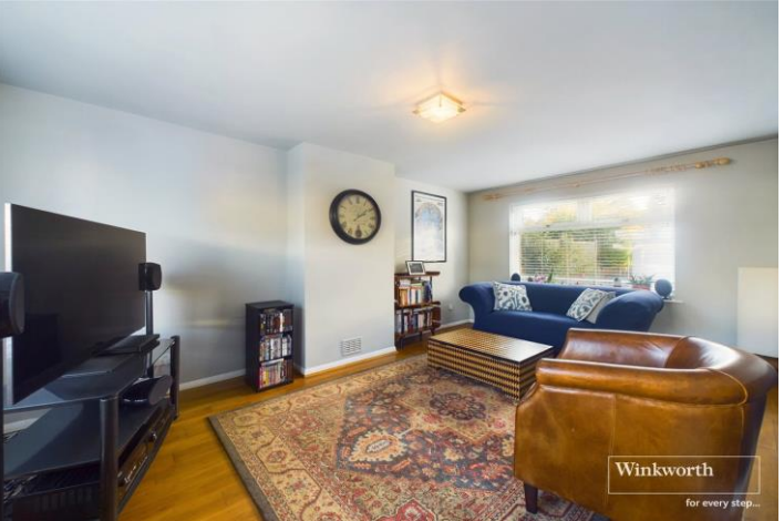
ELTHORNE ROAD, KINGSBURY, LONDON, NW9 £525,000 FREEHOLD