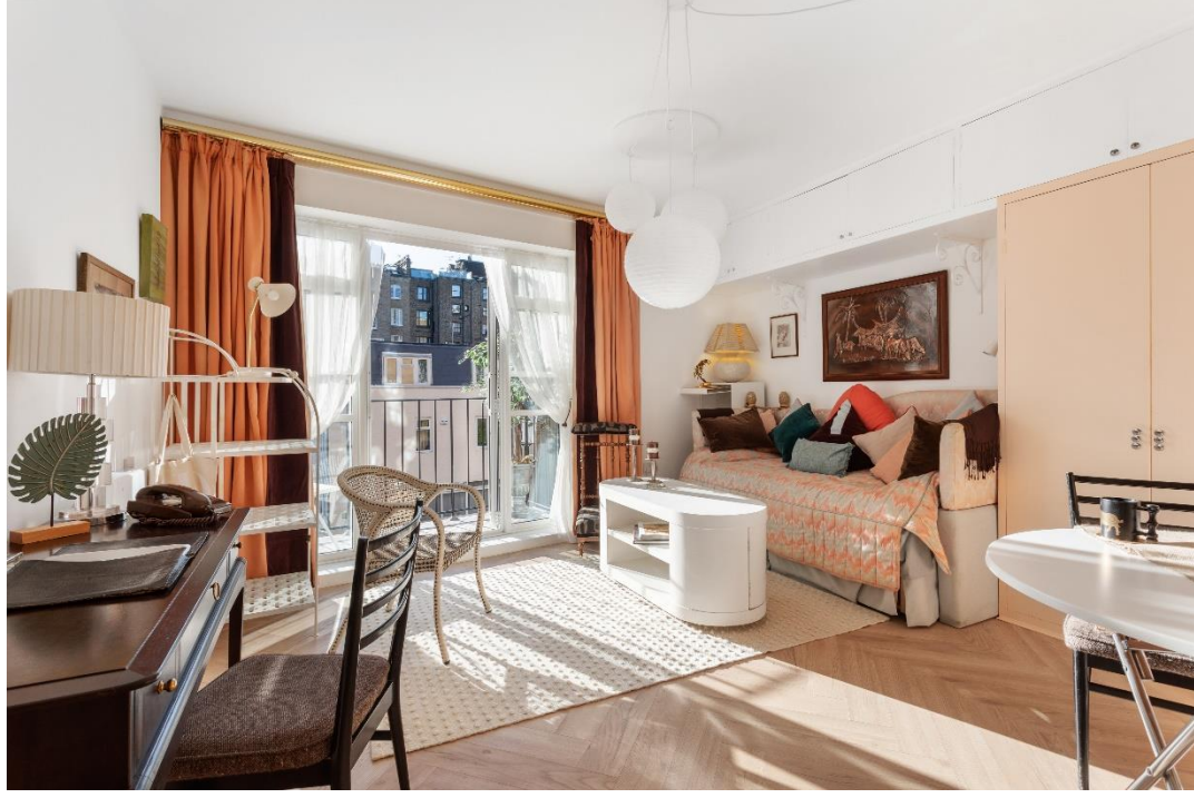
Studio | first floor | Lift | balcony