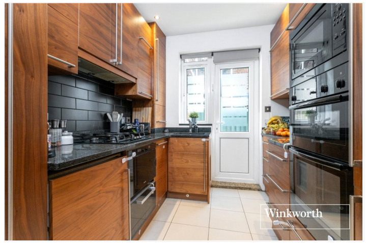
LONG LANE, LONDON, N3 £650,000 SHARE OF FREEHOLD