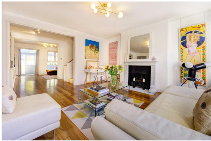
COURTNELL STREET, W2 £3,725,000 FREEHOLD

A VERY WELL ARRANGED, FOUR STOREY, FAMILY HOME SITUATED ON ONE OF NOTTING HILL'S MOST DESIRABLE STREETS IN THE HEART OF THE ARTESIAN VILLAGE.