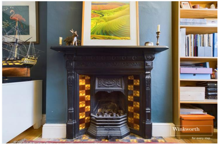
WANTAGE ROAD, BERKSHIRE, RG30 2SN OFFERS IN EXCESS OF £500,000 FREEHOLD