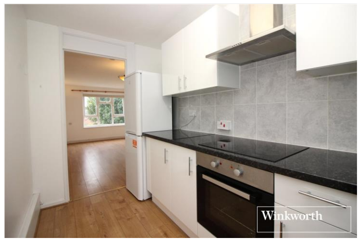
CLYDESDALE CLOSE, WD6 £225,000 LEASEHOLD