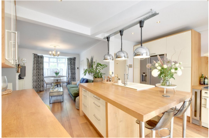
BLACKHEATH HILL, GREENWICH, LONDON, SE10 £875,000 FREEHOLD

A BEAUTIFUL FOUR BEDROOM, THREE STOREY TERRACED HOUSE WHICH IS WELL LOCATED JUST OFF THE OPEN HEATH AND IS PRESENTED IN OUTSTANDING DECORATIVE ORDER THROUGHOUT. MEASURING AN IMPRESSIVE 1576 SQ FT!