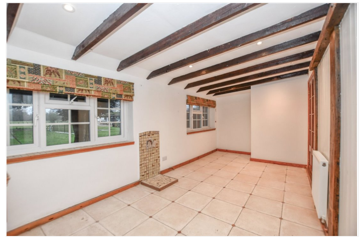
MAGPIE & PARROT, ARBORFIELD ROAD, SHINFIELD, READING, BERKSHIRE, RG2 9EA £550,000 FREEHOLD