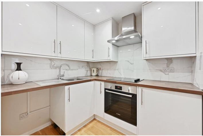
WESTBOURNE GROVE TERRACE, W2 £350,000 LEASEHOLD