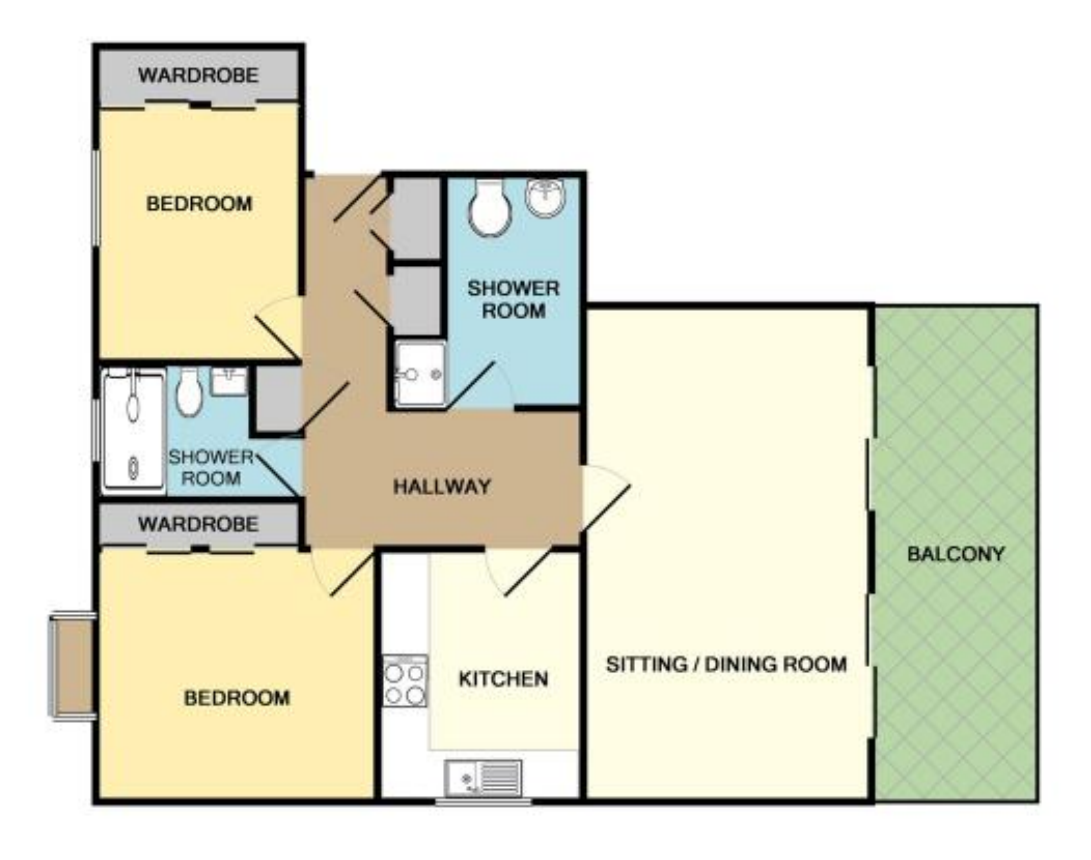
This Floor Plan is for guidance only and is NOT to SCALE Made with Metropix $2016

If you are considering purchasing this property as a 'buy to let' investment, please contact a member of our Lettings team on 01202 767313 for a rental valuation