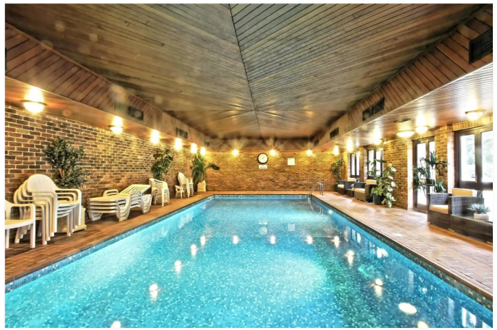
THE OASIS, 45 LINDSAY ROAD, POOLE, BH13