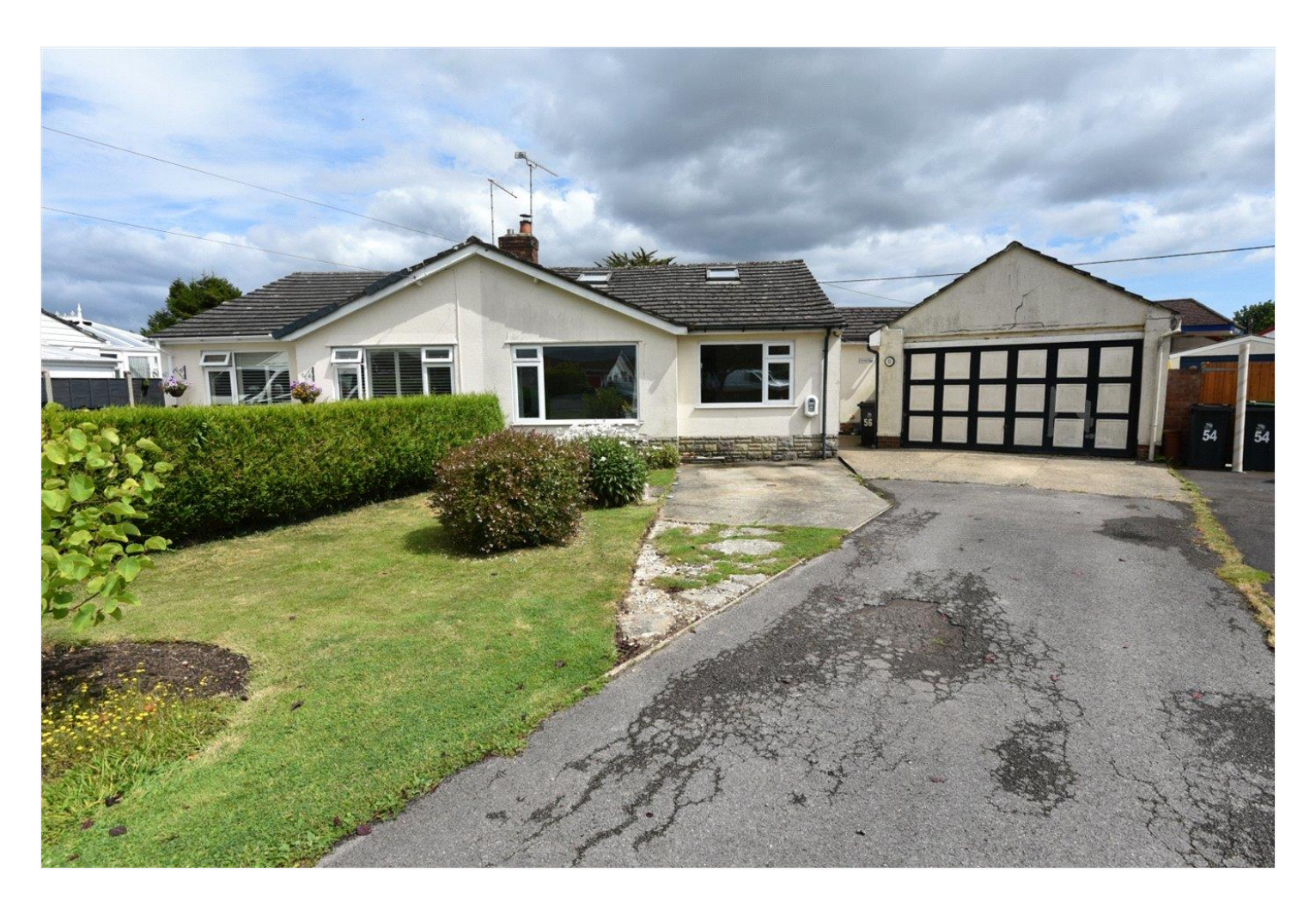
56 MARTINDALE AVENUE, WIMBORNE, DORSET, BH21 2LF £399,950 FREEHOLD