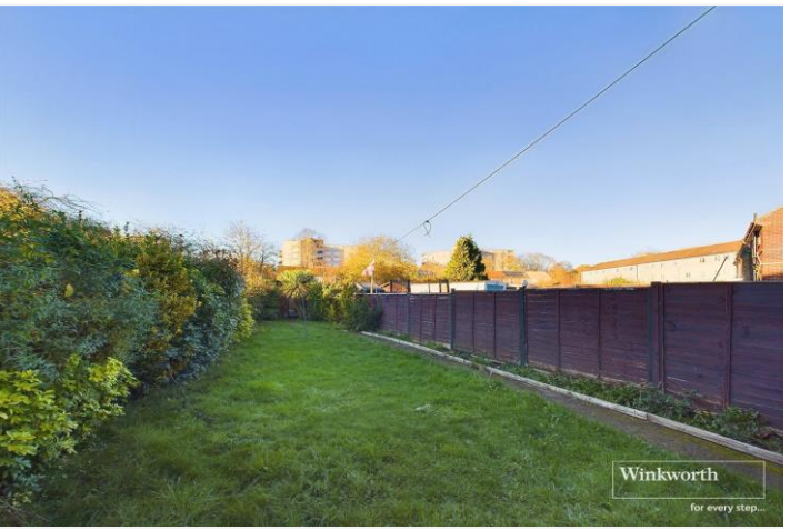
VIRGINIA WAY, BERKSHIRE, RG30 3QS GUIDE PRICE £440,000 FREEHOLD