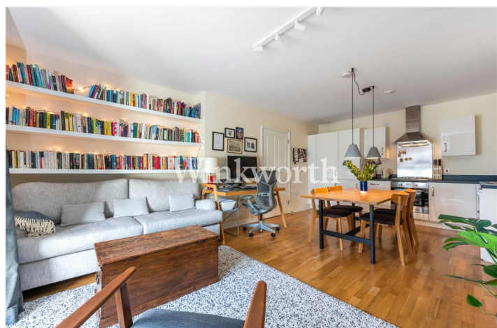
BIRDSMOUTH COURT, N15 £380,000 LEASEHOLD