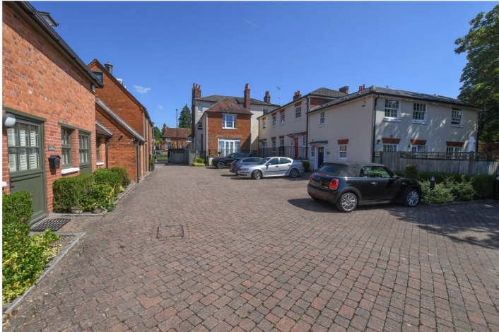
APARTMENT 4, HULBERT GATE, SHUTE END, WOKINGHAM, RG40 1BS £350,000 LEASEHOLD

OFFERED TO THE MARKET WITH NO ONWARD CHAIN COMPLICATIONS IS THIS UNIQUE FIRST FLOOR 2 BEDROOM APARTMENT CONVERTED IN 2006 FROM A GRADE II LISTED BUILDING.