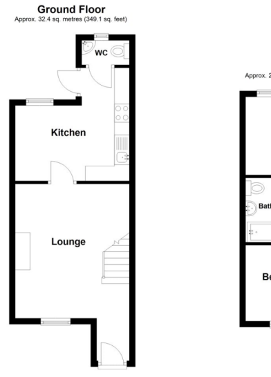
Total area: approx. 61.3 sq. metres (659.7 sq. feet)