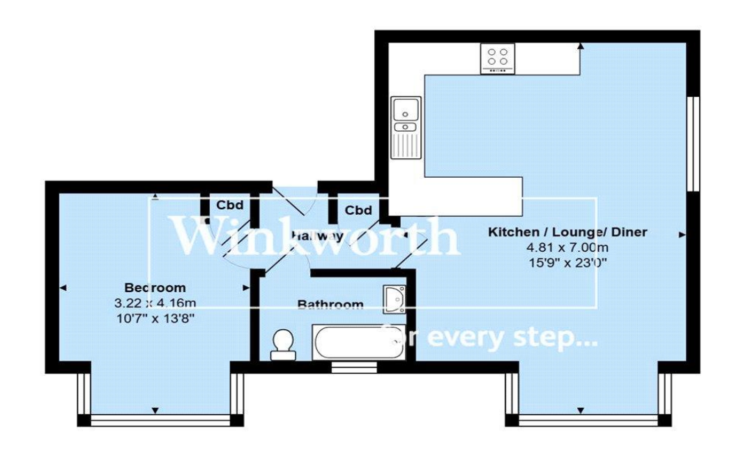
Total Area: 53.2 m<sup>2</sup> ... 573 ft<sup>2</sup>

All measurements are approximate and for display purposes only