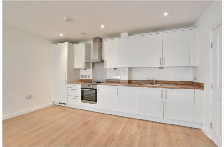
BARGE WALK, GREENWICH, LONDON, SE10 £385,000 LEASEHOLD

A BEAUTIFULLY PRESENTED AND LARGE ONE BEDROOM GROUND FLOOR MAISONETTE, THAT FEATURES A PRIVATE TERRACE AND SECURE UNDERGROUND PARKING! LOCATED ON THE NORTH GREENWICH PENINSULA! EWS1 COMPLIANT!