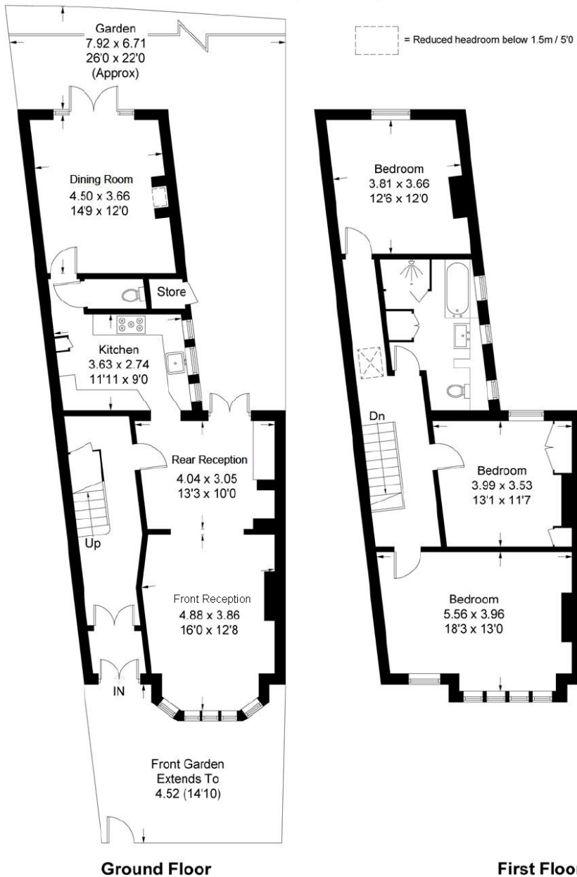
Illustration for identification purposes only, measurements are approximate, not to scale. (ID257293)

This floorplan is for illustration purposes only and is not to scale. The position and size of doors, windows, appliances and other features are approximate.