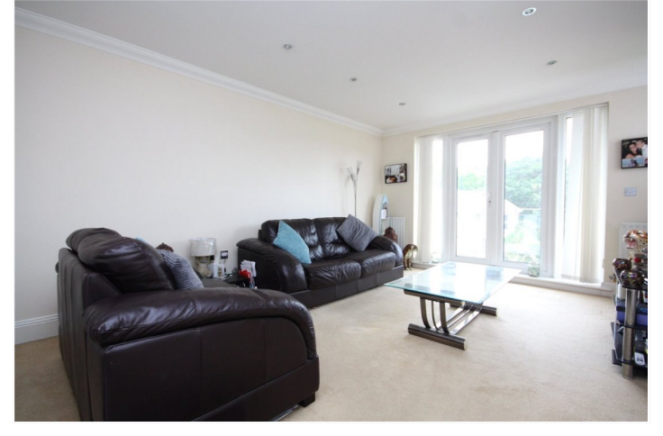
ELMHURST HEIGHTS, STUDLAND ROAD, ALUM CHINE, BOURNEMOUTH, DORSET, BH4