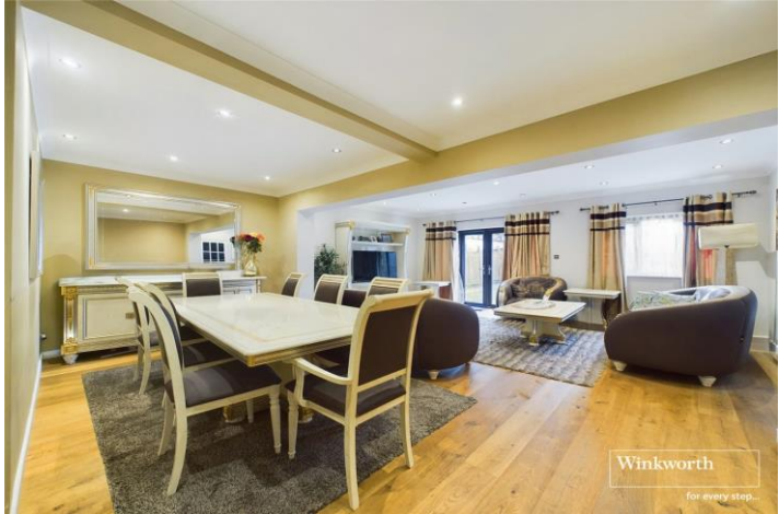
BRUNO PLACE, KINGSBURY, LONDON, NW9 £1,300,000 FREEHOLD