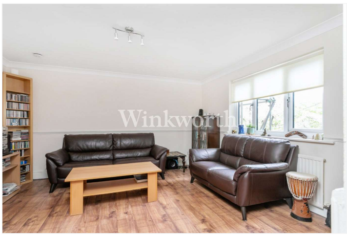
OLD FARM AVENUE, N14 £280,000 LEASEHOLD