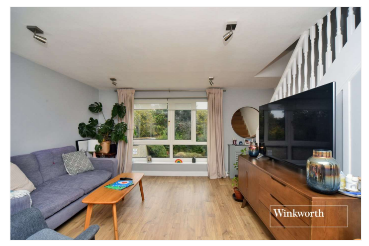
LANGLEY PARK ROAD, SUTTON, SM2 £375,000 LEASEHOLD

AN INCREDIBLY SPACIOUS SPLIT LEVEL MAISONETTE FEATURING RESIDENT'S PARKING AND GARAGE EN BLOC SET IN A RESIDENTIAL ROAD CLOSE TO SUTTON TRAIN STATION