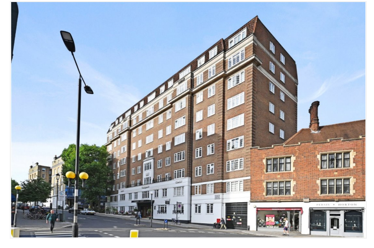
VICARAGE COURT, W8 £850,000 LEASEHOLD

A BRIGHT TWO BEDROOM APARTMENT WITH ROOF TOP VIEWS SITUATED ON THE 7TH FLOOR (WITH LIFTS) OF A WELL MAINTAINED PORTERED BLOCK IN CENTRAL LOCATION OFF KENSINGTON CHURCH STREET.