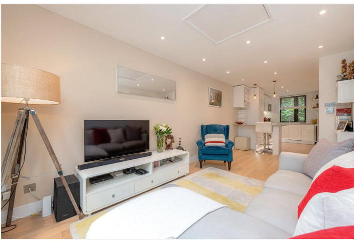
TAVISTOCK CRESCENT, W11 £425,000 LEASEHOLD