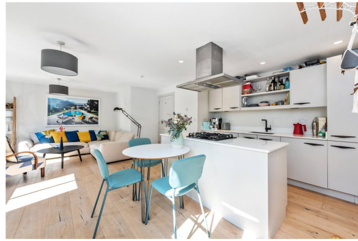
CLAPTON SQUARE, LONDON, E5 'OFFERS IN EXCESS OF' £650,000 LEASEHOLD