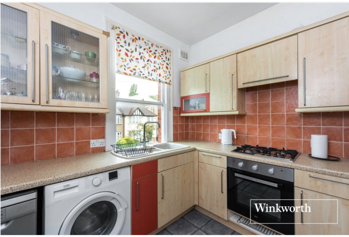
LICHFIELD GROVE, LONDON, N3 £500,000 LEASEHOLD