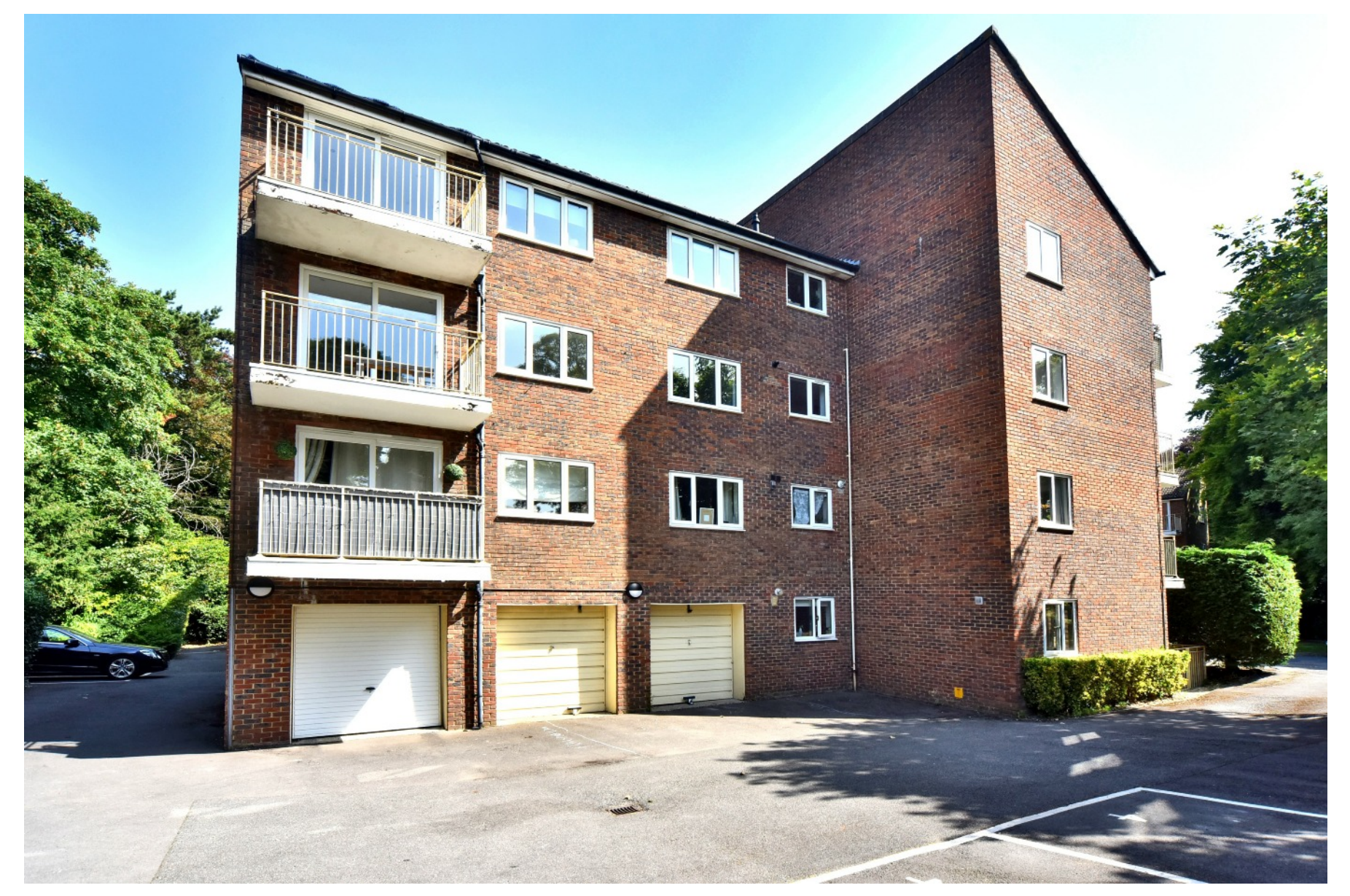
Under the Consumer Protection Regulations 2008, these Particulars are a guide and act as information only. All details are given in good faith and are believed to be correct at time of printing. Winkworth give no representation as to their accuracy and potential purchasers or tenants must satisfy themselves by inspection or otherwise as to their correctness. No employee of Winkworth has authority to make or give any representation or warranty in relation to this property.