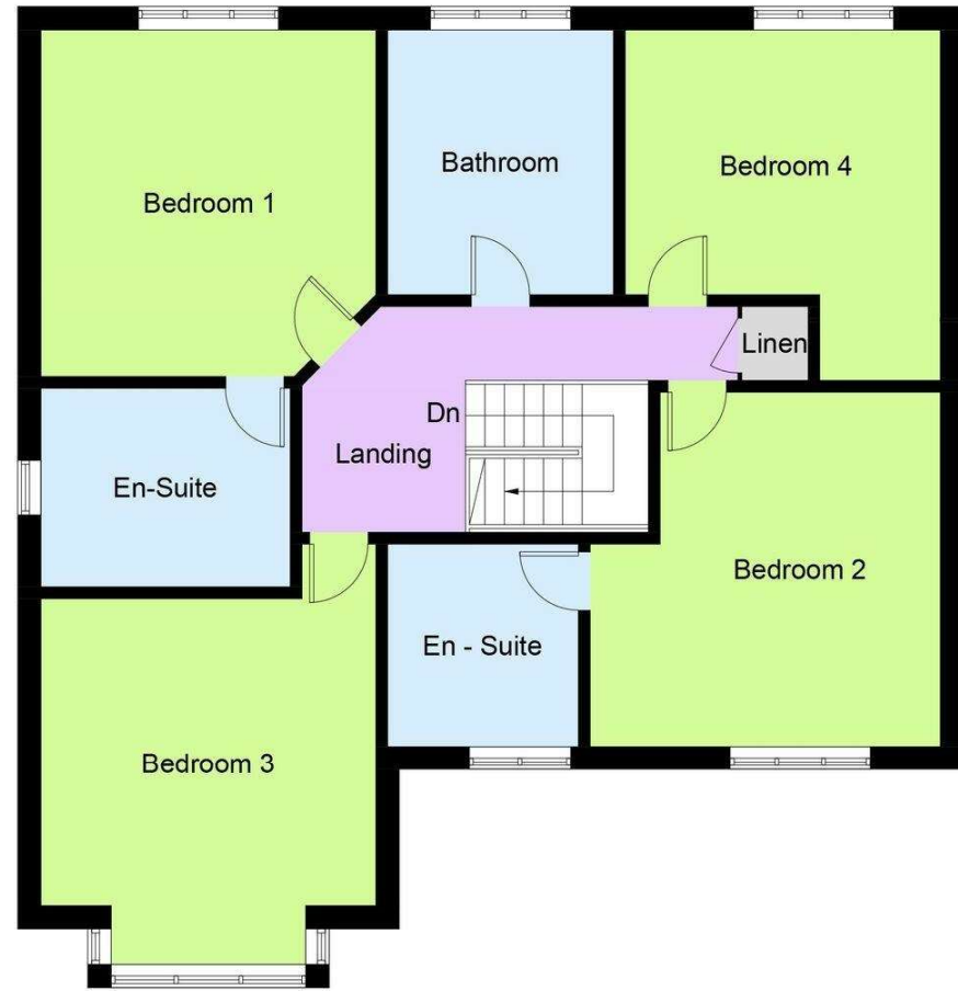
First Floor 1258 Sq ft

Illustration for identification purposes only, measurements are approximate, not to scale. FloorplansUsketch.com © 2022 (ID947755)