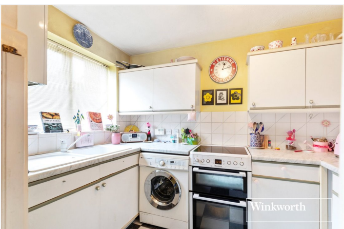
GREENWAY CLOSE, LONDON, N11 £200,000 LEASEHOLD