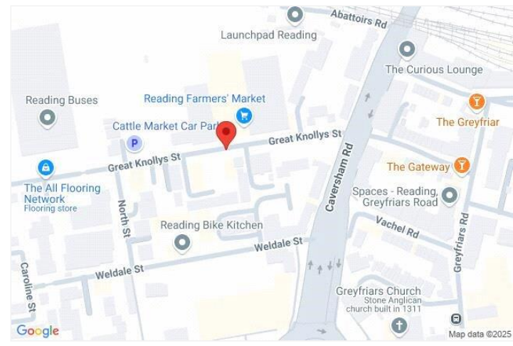
LION COURT, READING, BERKSHIRE, RG1 7HD GUIDE PRICE £225,000 LEASEHOLD