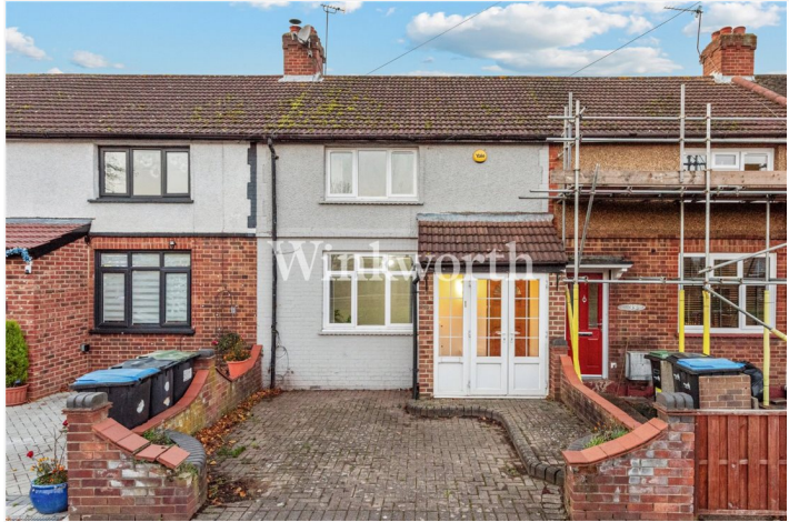
KIPLING TERRACE, LONDON, N9 £439,995 FREEHOLD

A LIGHT AND AIRY THREE BEDROOM HOUSE LOCATED CLOSE TO SCHOOLS AND OPENS-SPACES, OFFERED FOR SALE WITH NO ONWARD CHAIN.