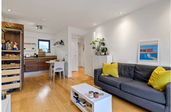
NOBLE HOUSE, GRAHAM ROAD, LONDON, E8 'OFFERS IN EXCESS OF' £375,000 LEASEHOLD