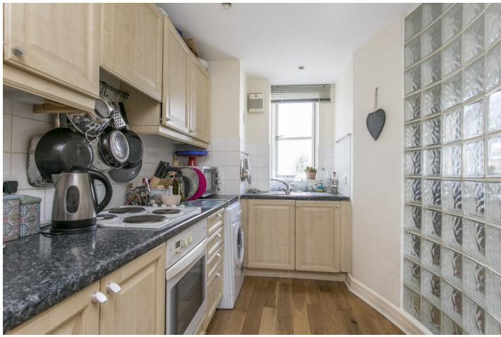
EQUITY SQUARE, SHACKLEWELL STREET, E2 £495 PER WEEK FURNISHED

A TOP FLOOR SPLIT-LEVEL TWO BEDROOM APARTMENT IN THIS MODERN GATED DEVELOPMENT FEATURINGHIGH CEILINGS AND WOODEN FLOORS.