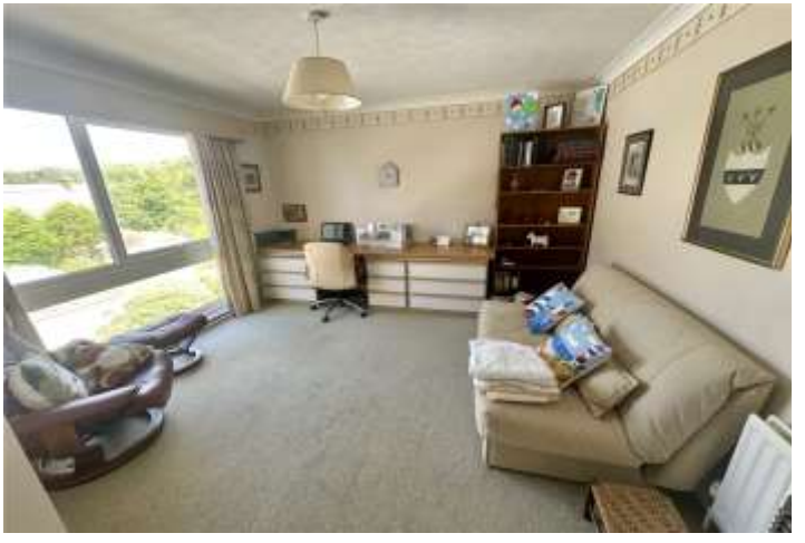
PARK LANE, MILFORD ON SEA, SHARE OF FREEHOLD, £600,000, COUNCIL TAX BAND-E, EPC- C

DELIGHTFUL THREE BEDROOM CLIFF TOP APARTMENT WITH TREMENDOUS COASTAL VIEWS OF THE ISLE OF WIGHT, HURST CASTLE, ACROSS TOWARDS CHRISTCHURCH BAY AND HENGISTBURY HEAD. SITUATED WITHIN WALKING DISTANCE TO THE VILLAGE CENTRE AND ALL ITS AMENITIES.