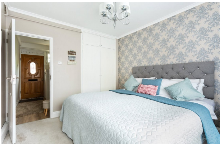
DERBYSHIRE STREET, LONDON, E2 £400,000 LEASEHOLD