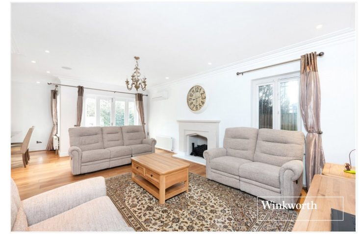
HENDON LANE, LONDON, N3 £1,600,000 FREEHOLD