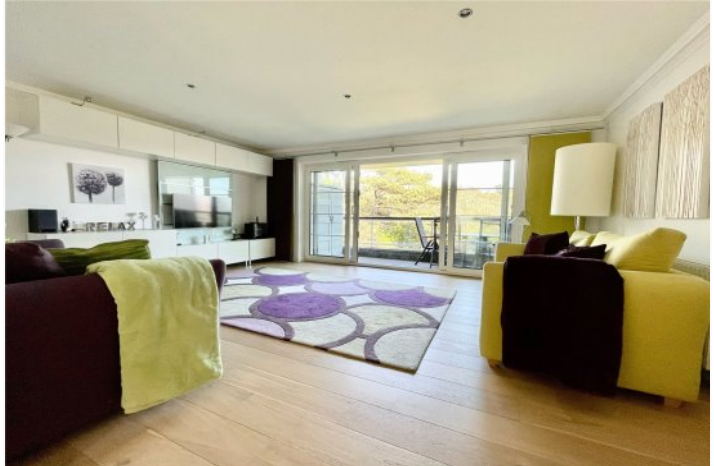
HAYES ON THE CHINE, STUDLAND ROAD, BOURNEMOUTH, DORSET, BH4