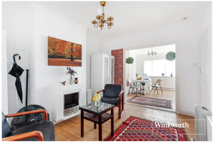
ENGEL PARK, MILL HILL EAST, LONDON, NW7 £875,000 FREEHOLD