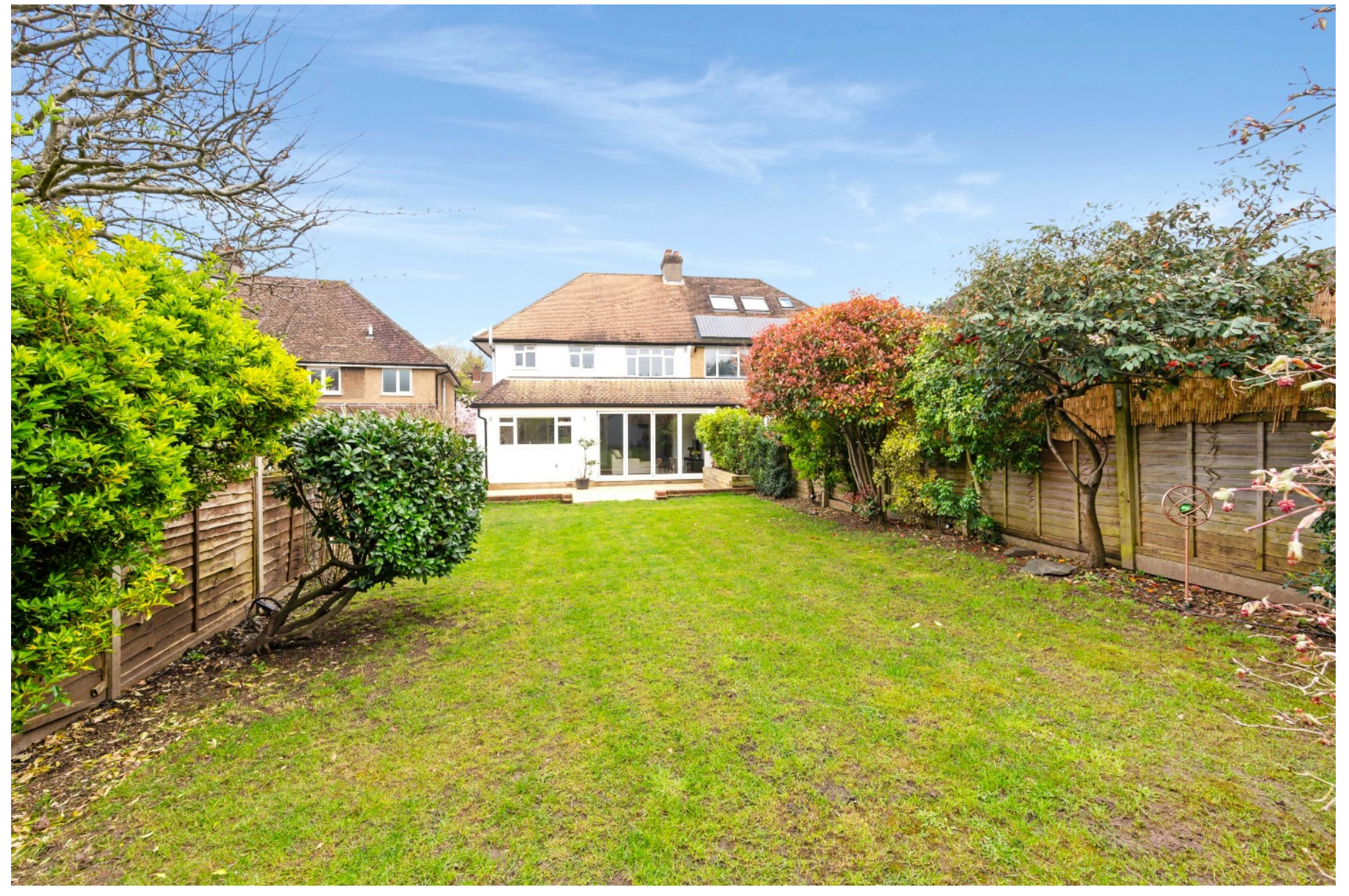
Under the Consumer Protection Regulations 2008, these Particulars are a guide and act as information only. All details are given in good faith and are believed to be correct at time of printing. Winkworth give no representation as to their accuracy and potential purchasers or tenants must satisfy themselves by inspection or otherwise as to their correctness. No employee of Winkworth has authority to make or give any representation or warranty in relation to this property.