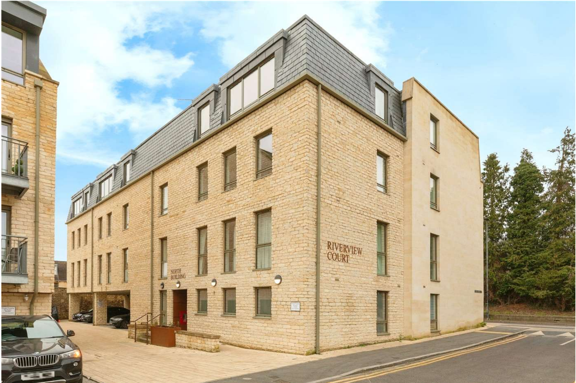
FLAT 7 NORTH BUILDING, RIVERSIDE, BATH, BA1 £350,000 LEASEHOLD