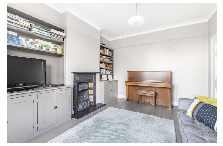
GIRTON ROAD, LEWISHAM, LONDON, SE26 £1,000,000.00 GUIDE PRICE

Elegant Edwardian home with scenic allotment views, set in a sought-after location near schools and transport. Features four spacious bedrooms, off-street parking, and a beautifully landscaped southwest-facing garden. Inside, enjoy a designer kitchen, serene colour palette, and charming period details like bay windows and traditional shutters. A perfect blend of classic charm and modern convenience!