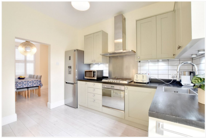
KEMSING ROAD, GREENWICH, LONDON, SE10 £1,100,000 FREEHOLD

WE ARE DELIGHTED TO OFFER THIS OUTSTANDING FIVE BEDROOM FAMILY HOME, THAT IS PRESENTED IN STUNNING ORDER, LOCATED IN THE HUGELY POPULAR HALSTOW SCHOOL CATCHMENT AREA IN EAST GREENWICH. MEASURING CIRCA 1577 SQ FT!