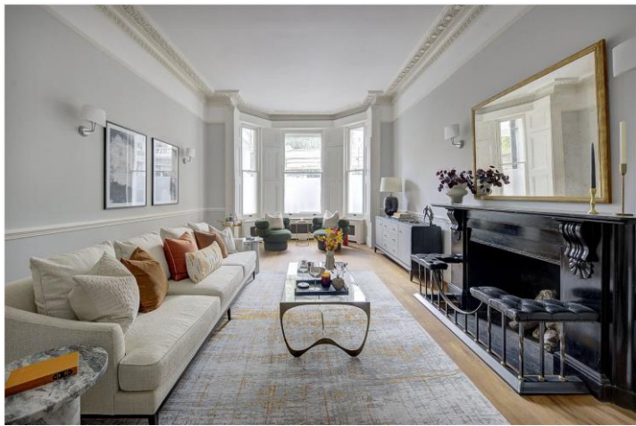
LINDEN GARDENS, W2 £2,750,000 SHARE OF FREEHOLD

A MOST IMPRESSIVE GROUND AND LOWER MAISONETTE, WITH GRAND PERIOD PROPORTIONS, SITUATED IN THIS INCREDIBLY CONVENIENT NOTTING HILL LOCATION, MOMENTS FROM KENSINGTON GARDENS.