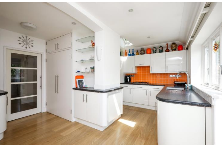
QUEEN ANNES GROVE, LONDON, W5