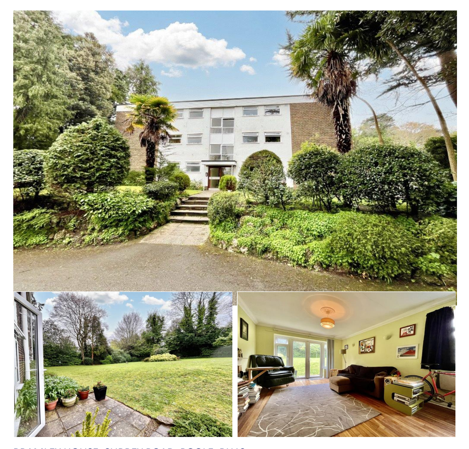
BRAMLEY HOUSE, SURREY ROAD, POOLE, BH12