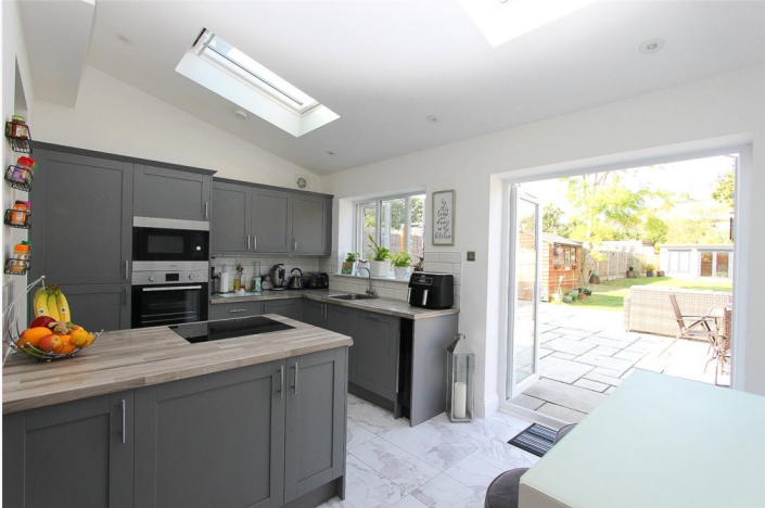
FLEMMING CRESCENT, LEIGH ON SEA Guide Price £625,000 to £650,000. FREEHOLD