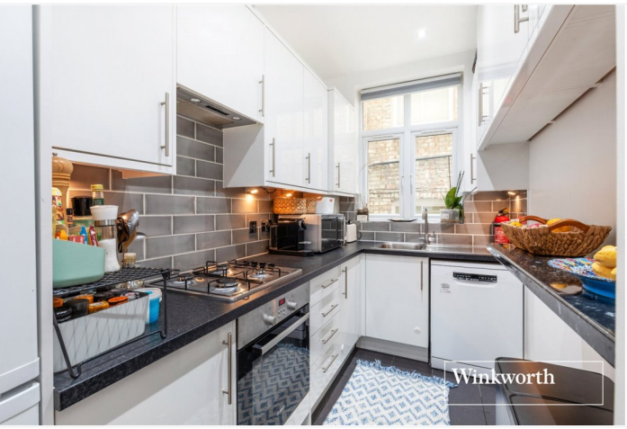
EVERSLEIGH ROAD, FINCHLEY, LONDON, N3 £650,000 LEASEHOLD